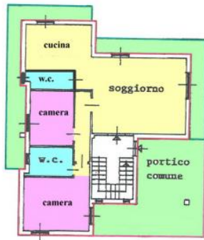
PIANO TERRA H = 2,76