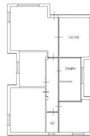
PIANO TERRA - H = 300 cm