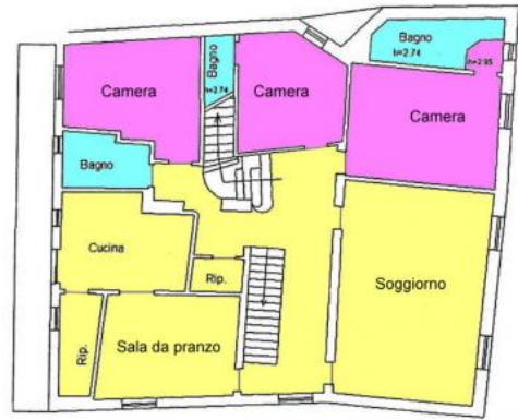
PIANO PRIMO H=2.97