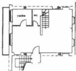
Piano Primo H= 2,70